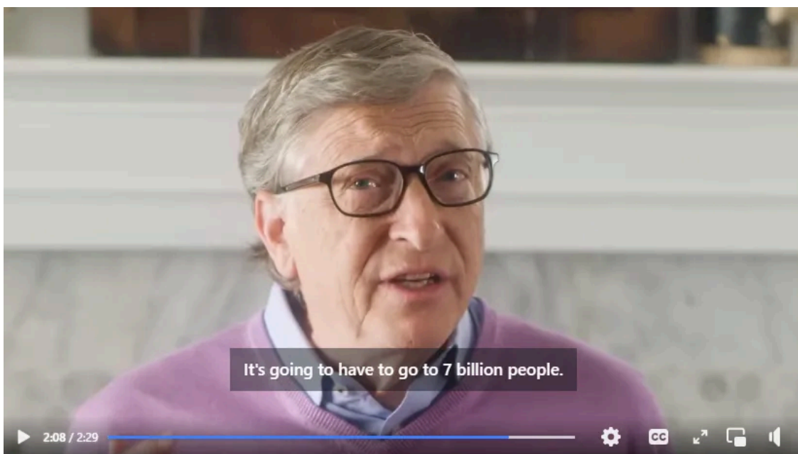
The race for a COVID-19 vaccine, explained

It's going to have to go to 7 billion people.