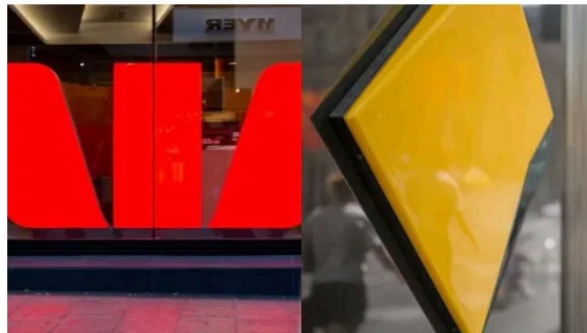
Two of Australia's biggest banks announce mandatory vaccinations for their employees. (ABC News)

Posted Thu 14 Oct 2021 at 2:36pm, updated Thu 14 Oct 2021 at 11:57pm